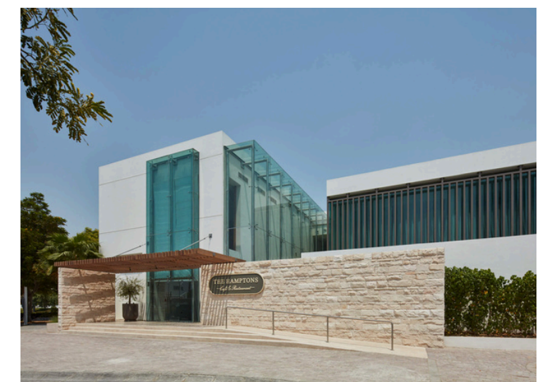
Moh'd Bin Rashid Al Maktoum, District One, Dubai