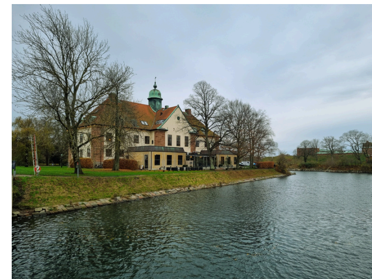
Malmöhusvägen 1, Malmö