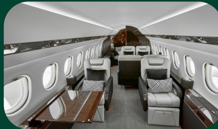
HZ-HKR, Falcon 900B, 15 seats, KSA