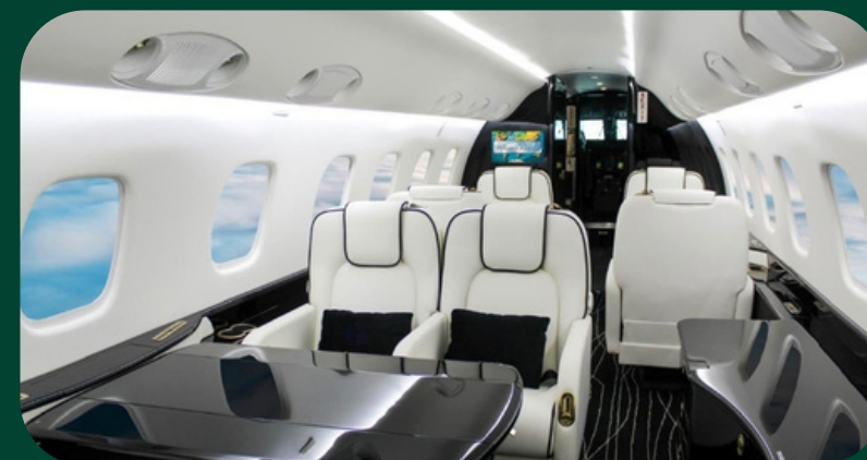
VT-VSS, Legacy 600, 15 seats, India